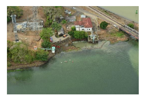
Figure 4: Gamboa Intake Station At Chagres River

The total cost of wash water tank, aeriation basin, the head house, the sedimentation basin, the filter building, pipe gallery, laboratory, quarters, clear-water basin, and the injection chamber cost was $558,168.