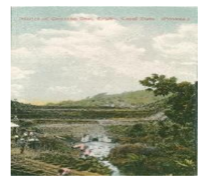
Figure 2: Camacho reservoir

Cocoli was later discontinued due to the flooding and creation of Miraflores Lake.