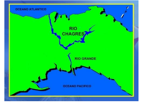
Figure 1: Grande River.

Americans took advantage of the reservoir built by the French Canal Company. They raised a 5.18 meterhigh (17 feet) dam getting a spillway elevation from mean sea level of 71.6 meters (235 feet).