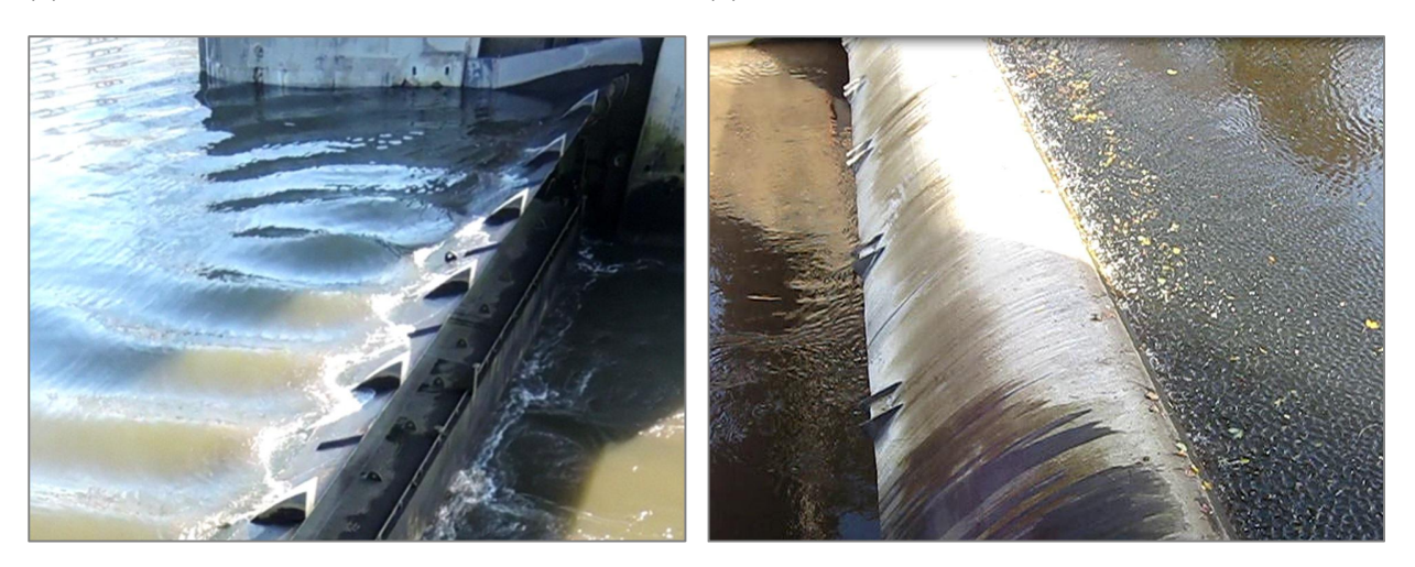
Figure 1: (a) Vibration of a lifting gate with upper flap gate and (b) of a sealing system at a submersible lifting gate