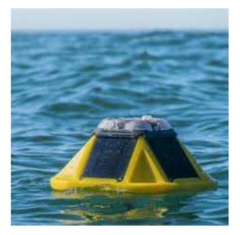
Figure 3: Light weight wave measurement devices.

Environmental information is as important as the underlying equations driving the UKC calculations. Real-time weather data such a tide gauges, wind sensors or wave buoys, are required to obtain a complete picture of the conditions in the port's region. The lack of such equipment is often a limitation in UKC risk management for many harbours around the world. Previously, access to this type of data was limited by cost, but in the past few years a series of light weight wave measurement devices (Ref Figure 3) have entered the market with the potential to make access to real-time wave data much more accessible to ports with cost constraints.