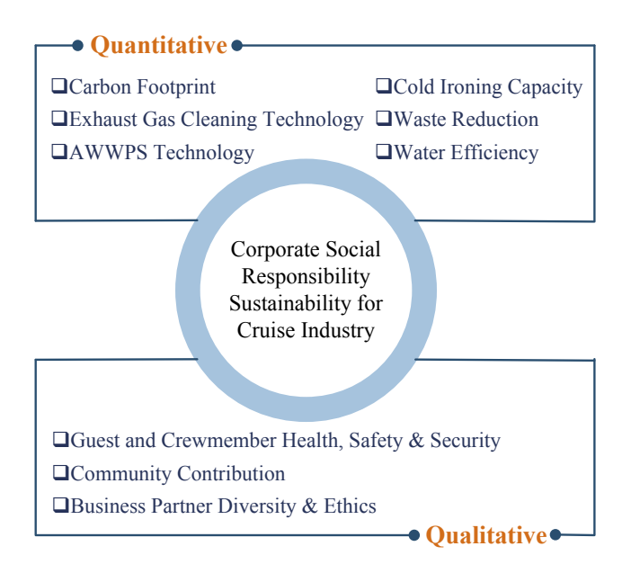
Figure 2. Corporate social responsibility for cruise industry

Second, it provides quantitative metrics to measure for all relevant environmental responsibility and social awareness to pursue responsible tourism and sustainable cruising. This application will also contribute to a bigger picture of climate change mitigation in the maritime industry and provide a concrete measure of what kind of adaption plan could be implemented. As in Figure 2, CSR in cruise business can be categorized into quantitative and qualitative aspects.